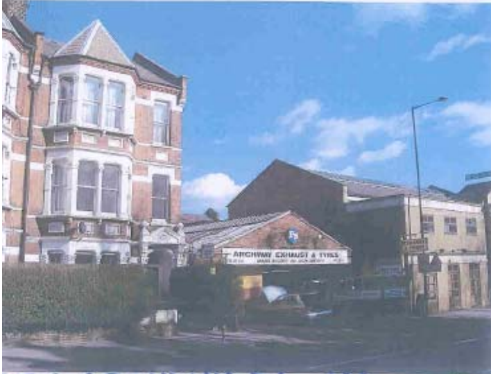
Views from Archway Road