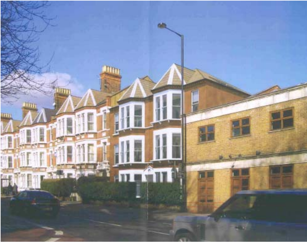
Indicative Front/ Street Elevation