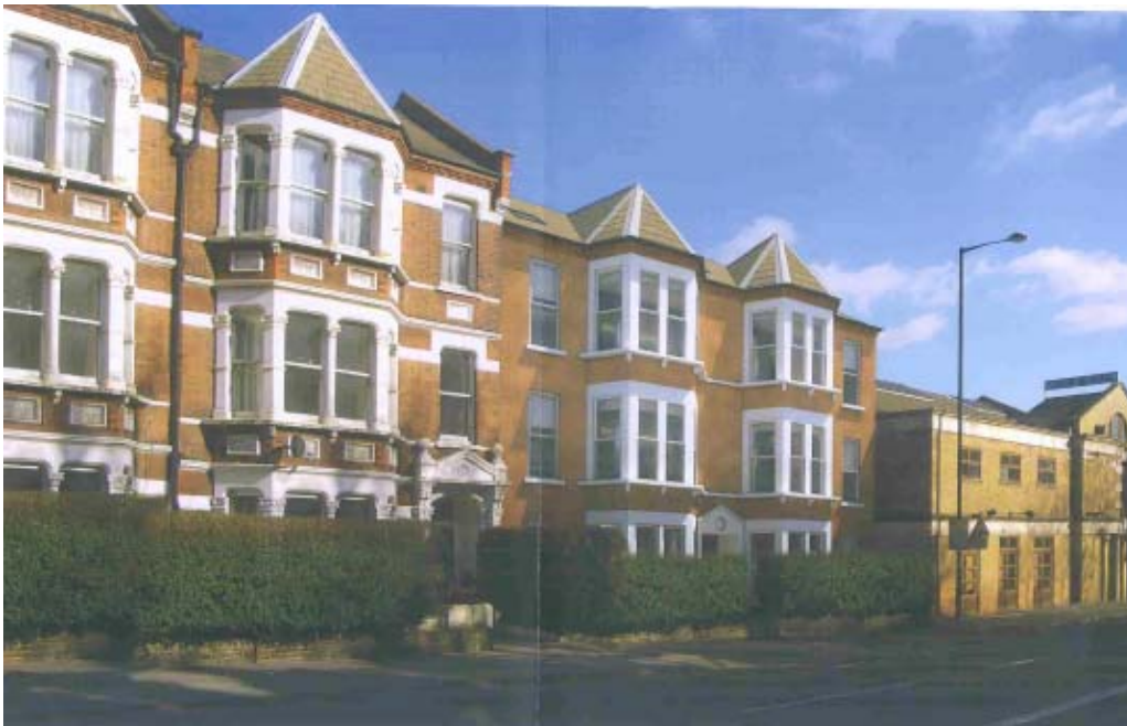
Indicative Front/ Street Elevation